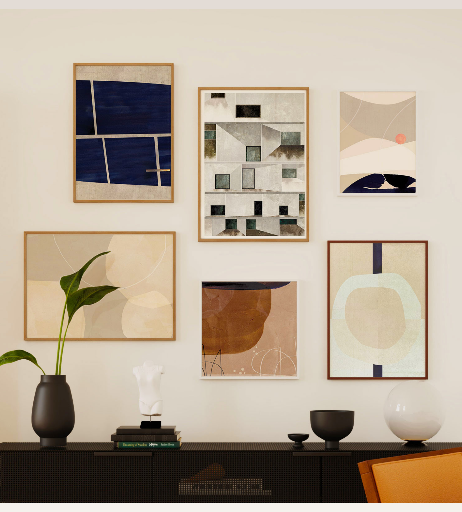
HOSPITALITY WALL ART PRINTS | BESPOKE ART CONSULTATION | MOOD BOARD & BRANDING DESIGN

Original wall art for residential, office and hospitality fit-outs. Making your commercial art-sourcing easy.